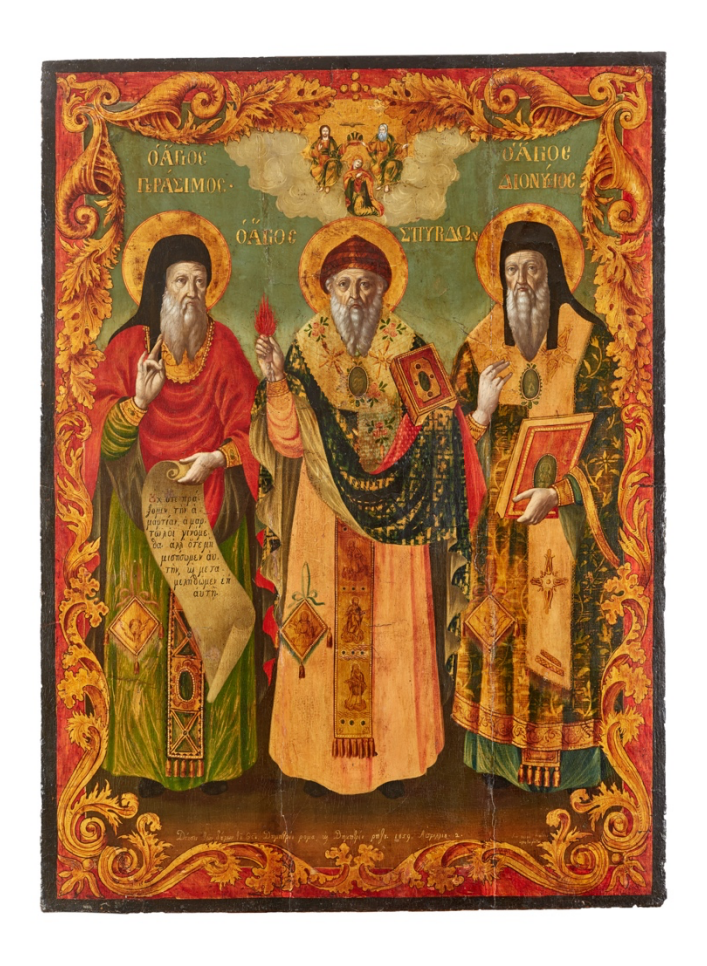
IMAGE 8 Philippos Hagiotaphites The Patron Saints of the Ionian Islands Ionian Islands, 1859 (no. 18)