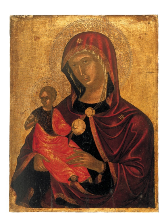
IMAGE 4 Nikolaos Tzafoures Madre della Consolazione Crete, c. 1490/1500 (no. 13)