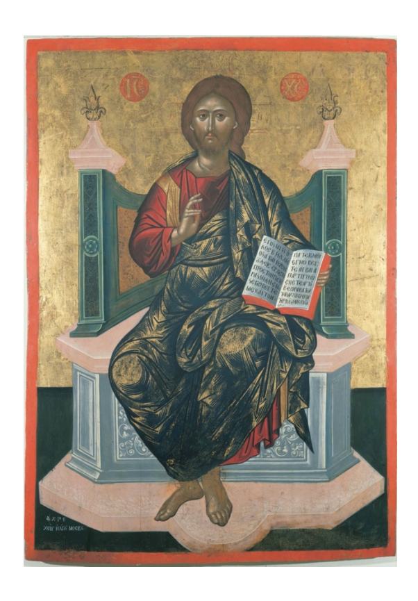
IMAGE 5 Elias Moschos Christ Pantokrator Greece (Zakynthos), 1653 (no. 15)