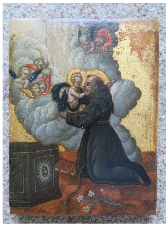
IMAGE 7 Victor Saint Anthony of Padova Greece, Crete or Venice end of 17th century (no. 17)