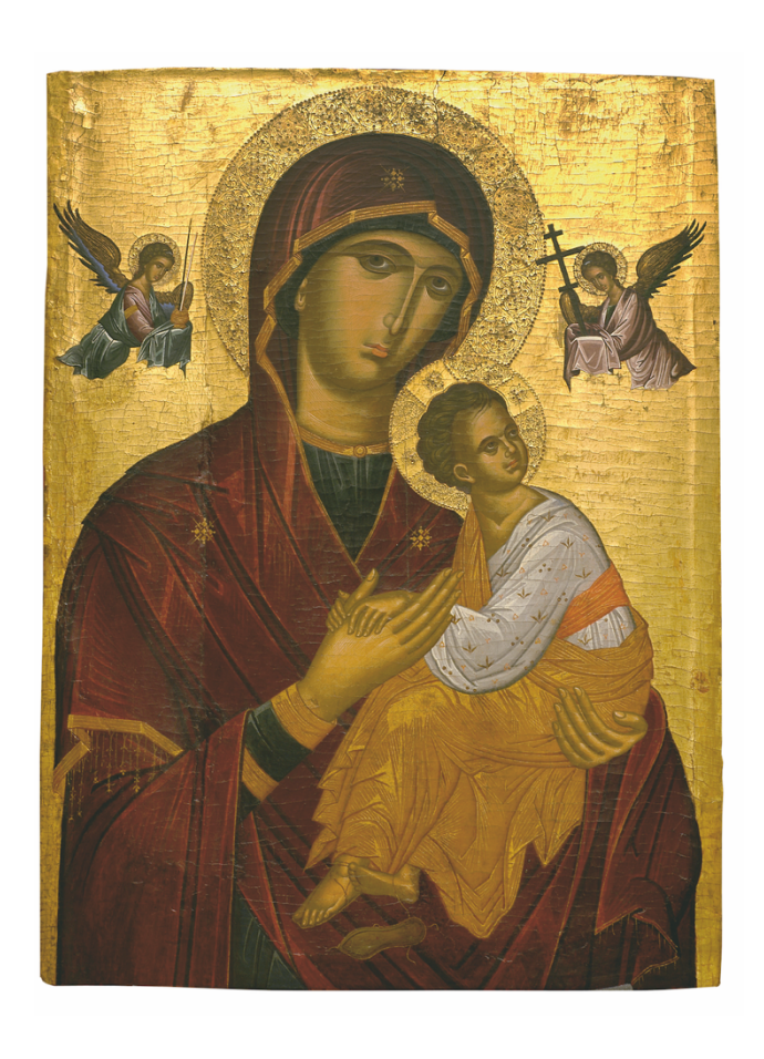
IMAGE 9 Andreas Ritzos (attr.) Mother of God of the Passion Crete, end of 15th century (21)