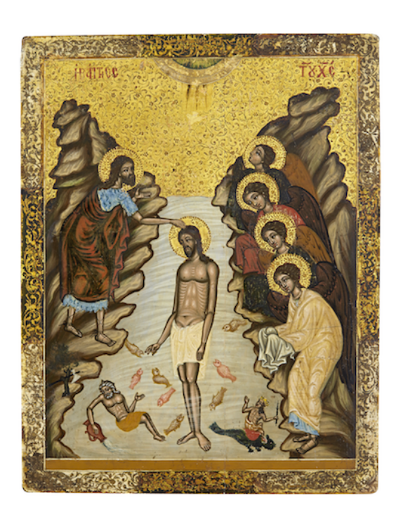
IMAGE 11 Girgis Al-Musawwir (attr.) Baptism of Christ Syria, 2nd half 18th century (23)