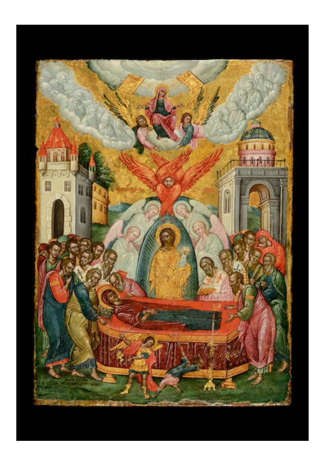
IMAGE 6 Konstantinos Tzanes Dormition of the Virgin Crete, 1677 (no. 16)